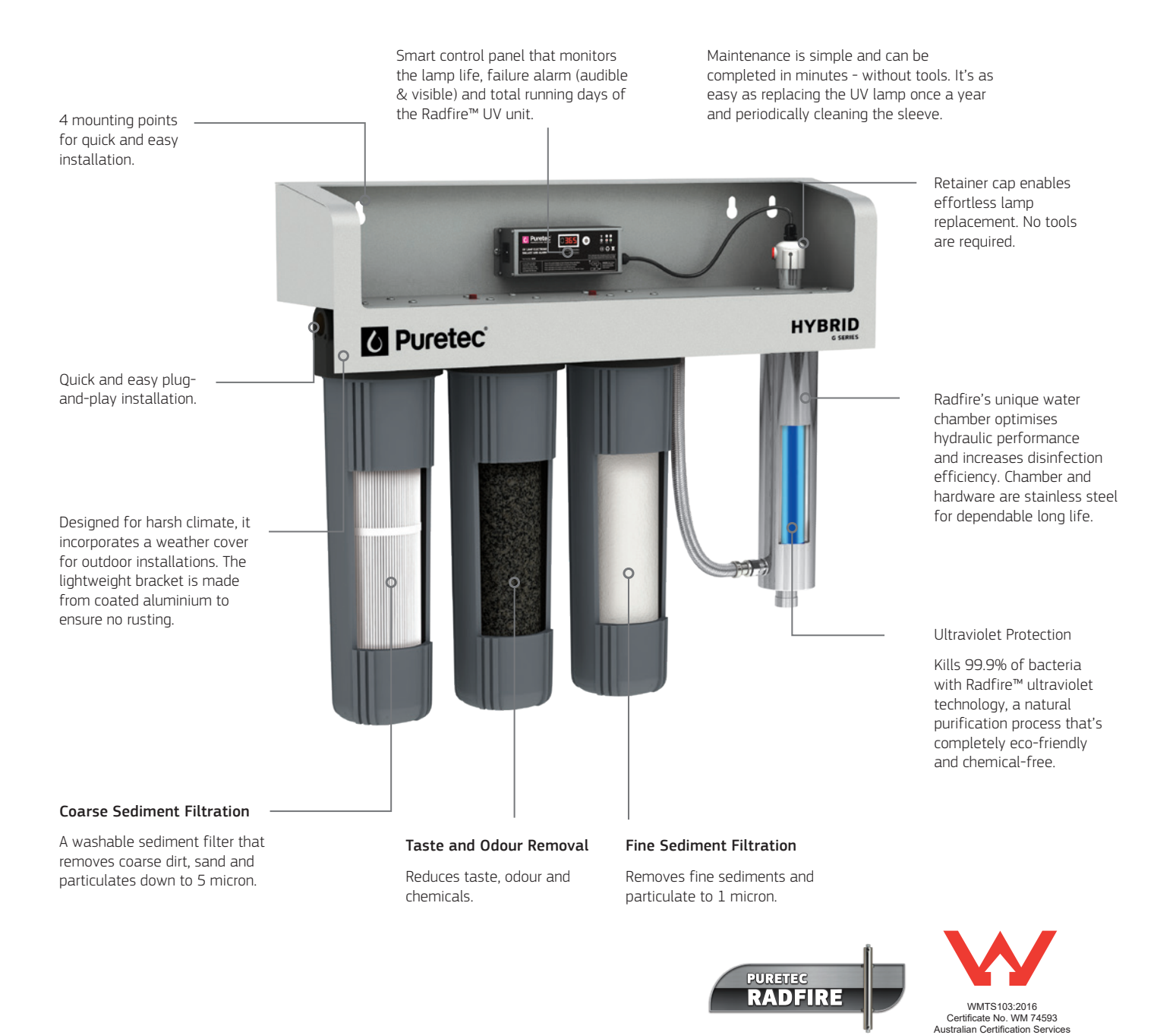
DIAGRAM & FILTRATION TECHNOLOGY