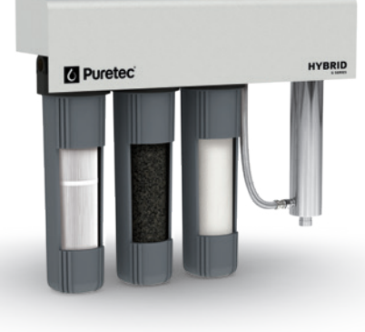
10", 1 connection, max. flow: 60 Lpm